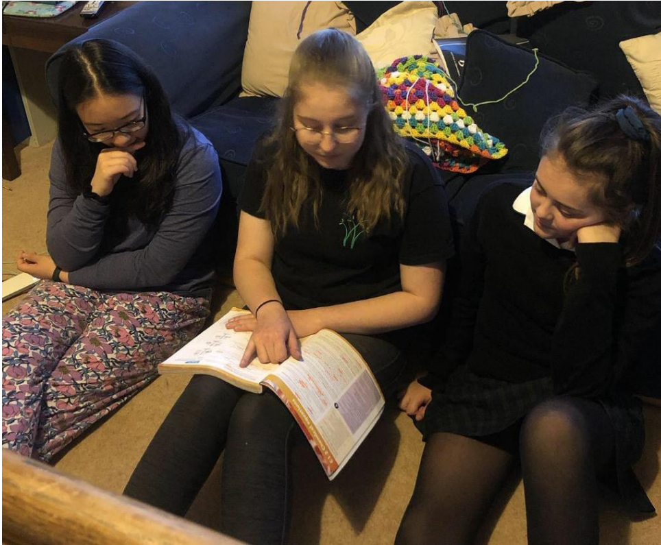
The girls have been studying hard for their class and public examinations this week.